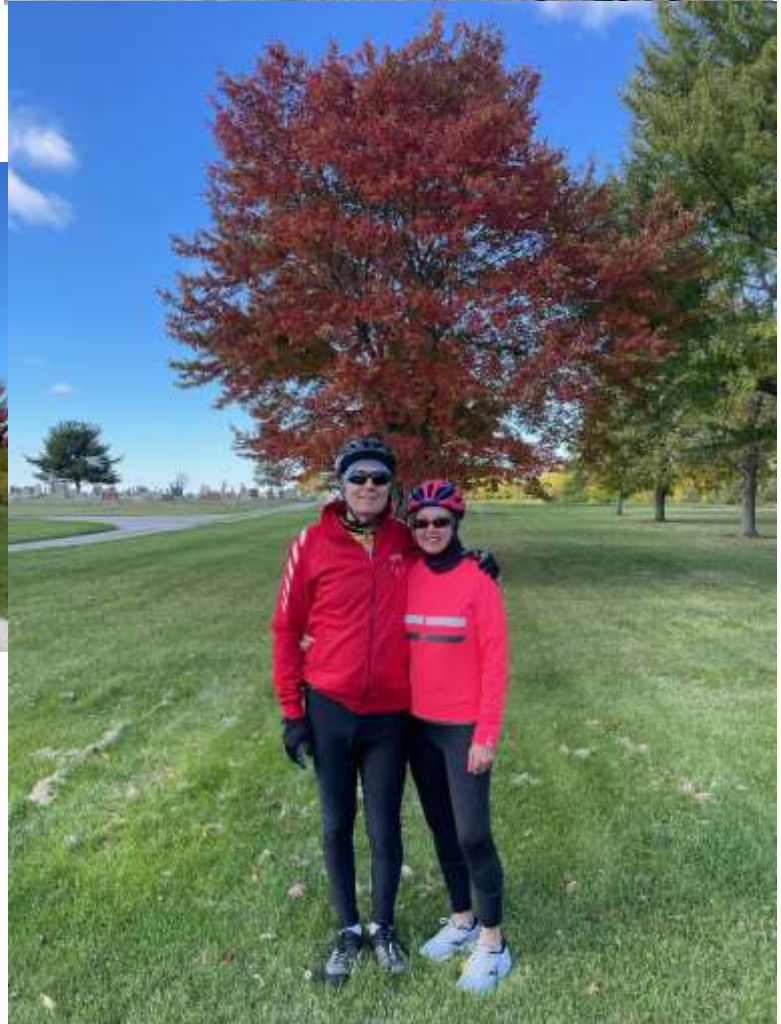
Fall FOS Picnic Ride Pics