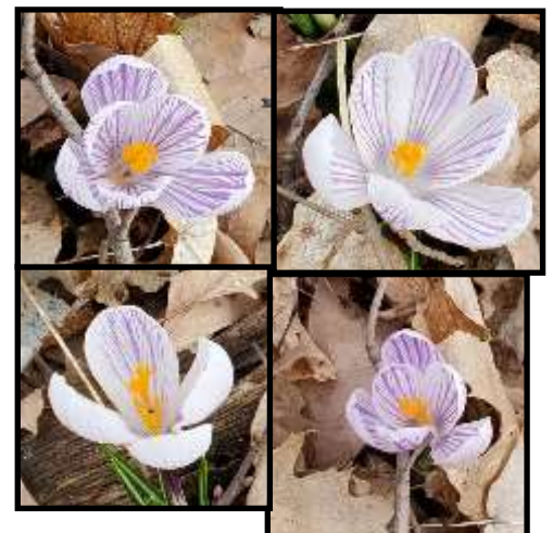
Spring is appearing in Hickory Creek!