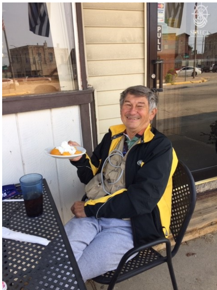
“Slow man with his peaches”